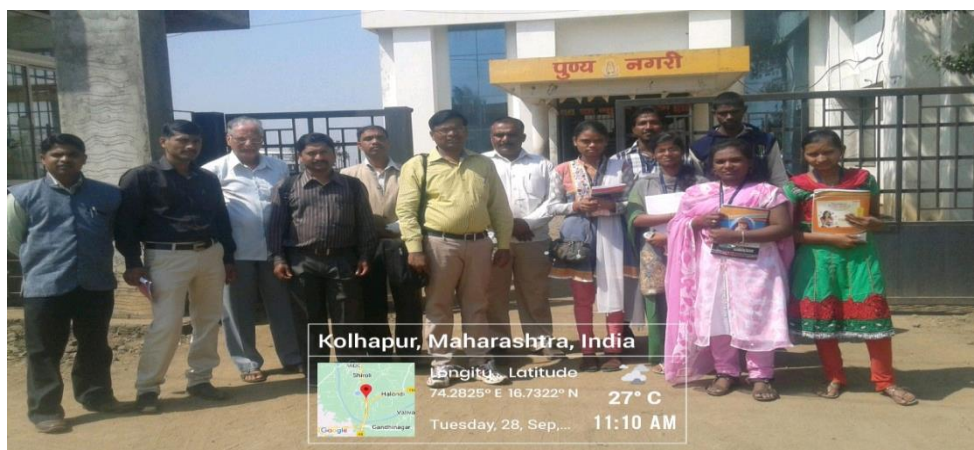
Study tour at daily Punya Nagri press, Kolhapur